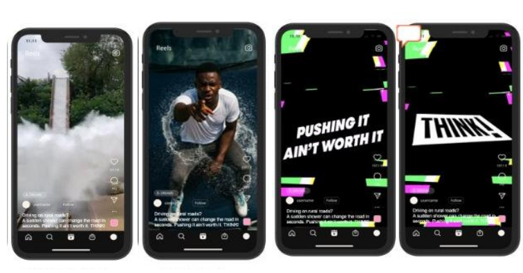
*mock-ups, not final creative

We are also developing a series of short video assets for social media to land a quick, visual message about how different conditions can catch you out on the road and the need to slow down.