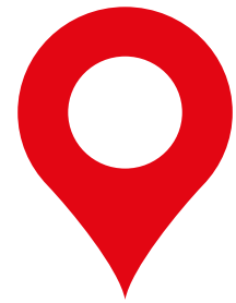
Fatal (one person or more killed)

The severity of the most severely injured casualty.