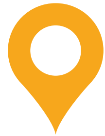
Serious (one person or more seriously injured)