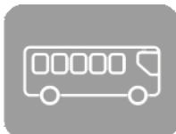
Bus / coach