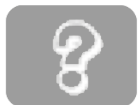
Other / unknown