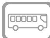
Bus / coach