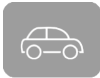
Car (excl Taxi)

May not have been damaged or injured a casualty but their presence in some way played a part in the events leading up to the collision: