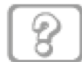
Other / unknown