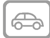
Car (excl Taxi)

These are colour-coded in the report 'pop up' by severity of casualty state (fatal, serious or slight).