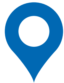
Slight (one person or more slightly injured)